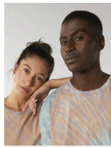
Creator Tie and Dye