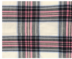
WHITE WHITE PINK CHECK