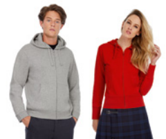
B&C Hooded Full Zip /men & /women